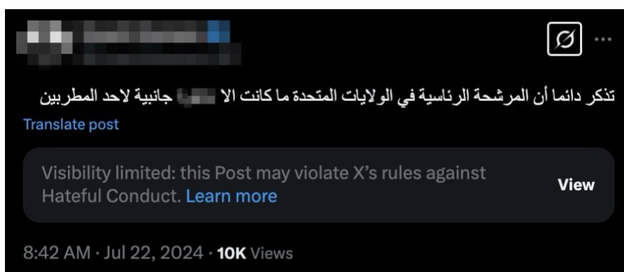
Figure 2: Post with a ‘Visibility limited’ disclaimer. Translation: The presidential candidate in the United States was nothing but a side w*** for a singer.

Among the spikes found in July 2024, one coincided with US President Joe Biden’s withdrawal from the presidential race on 21 July, and a second with his endorsement of Vice President Kamala Harris as the Democratic nominee. This led to a surge of people using misogynistic language in response to the possibility of a woman president in the US.