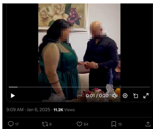
Figure 3: Post containing gendered derogatory remarks. Translation of post: Now do you see why you should listen to me?

Figure 3 is a post with a label that body shamed women. The author insinuated that men who do not embrace their masculinity may find themselves with women who do not align with conventional beauty standards.