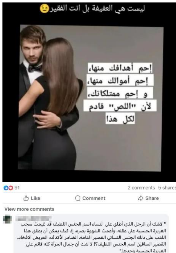
Figure 9: Post portraying women as a 'gold diggers'. The post translates as follows:

Several public red pill pages and accounts are active on Facebook, including those managed by influencers with tens of thousands of followers. The example post below (Figure 9) employs derogatory and objectifying language to reinforce harmful gender stereotypes that women are "gold diggers." Comments from other users further degrade and objectify women, reflecting broader misogynistic discourse within these online communities.