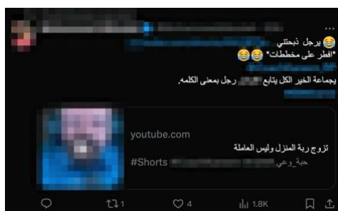
Figure 12: Post by a red pill influencer who criticizes women from seeking independence through work. Translation of post: Marry a housewife, not a working woman.

Translation of reply by a follower: Man, you crack me up. Everyone, I encourage you to follow [account name] this is a man in every sense of the word.