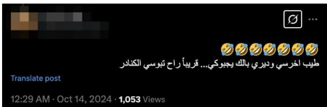
Figure 7: Threatening post made against a female TV host who criticised parliament. Translation: “Shut up and be careful they don’t come and get you... soon you will be kissing shoes.”

professional engagement. For instance, Figure 7 illustrates a threat made against a female TV host who had criticised parliament.