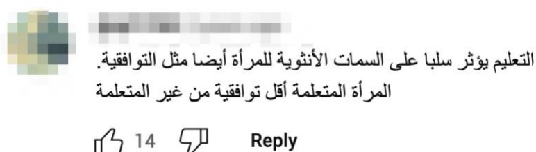
Figure 11: Post translation: Education negatively affects feminine traits and compatibility. Educated women are less compatible than non-educated ones.

Followers of the red pill ideology in Jordan argue that the rise of feminism has contributed to increased financial independence among Jordanian women which in turn has led to delayed marriages and an increase in women remaining unmarried, deriding them as “old spinsters”. This messaging seeks to reaffirm the ‘natural order’ of traditional gender roles and demeans women as only useful when they are in traditional homemaking roles (Figure 12).