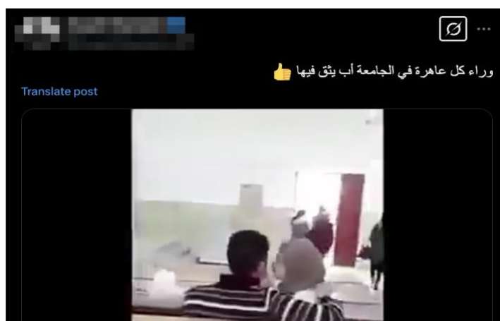
Figure 10: Post discouraging fathers from allowing their daughters to attend higher education institutes. Translation: Behind every whore in university is a father who trusts her.

Some Jordanian YouTube channels also focus on criticising feminism and alleged foreign influence on Jordan and its conservative society, blaming “the West” for introducing modern ideologies. This content is also apparent in the comment section of YouTube channels belonging to media outlets that publish supportive content on women's rights. Users argue that Western ideals and contemporary social movements have negatively impacted Jordanian women and society. They also assert that women’s increased focus on higher education, careers and independence has come at the expense of traditional homemaking roles (Figures 10 and 11).