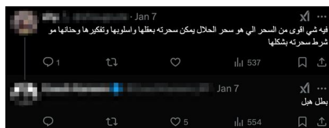
Figure 4: Is a comment left by a user viewing the post in Figure 3 regarding body shaming. Translation of comment: Perhaps she enchanted him with her mind, way of thinking, style, and her manners, not necessarily with her looks.