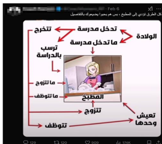
Figure 6: Another post with a traditionalist view of gender roles. Translation: “All the roads lead to the kitchen, they just like to confuse you with details.”