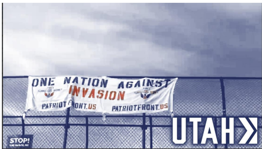
Images from PF's main Telegram channel, where photos and videos of the organization's offline activism are posted and shared daily.

PF's main Telegram channel has nearly 16,000 subscribers and is mainly used to circulate monthly reports on activism, sharing videos and photos, sharing (alternative) media appearances of Rousseau and sharing promotional materials. In addition, it hosts a website that contains its manifesto, links to the social media platforms on which it is active and a live feed of its Telegram channel. It also contains an application form for those interested in joining the movement, asking applicants to provide their motivation, religious beliefs, history of substance abuse, and skills that they can offer.