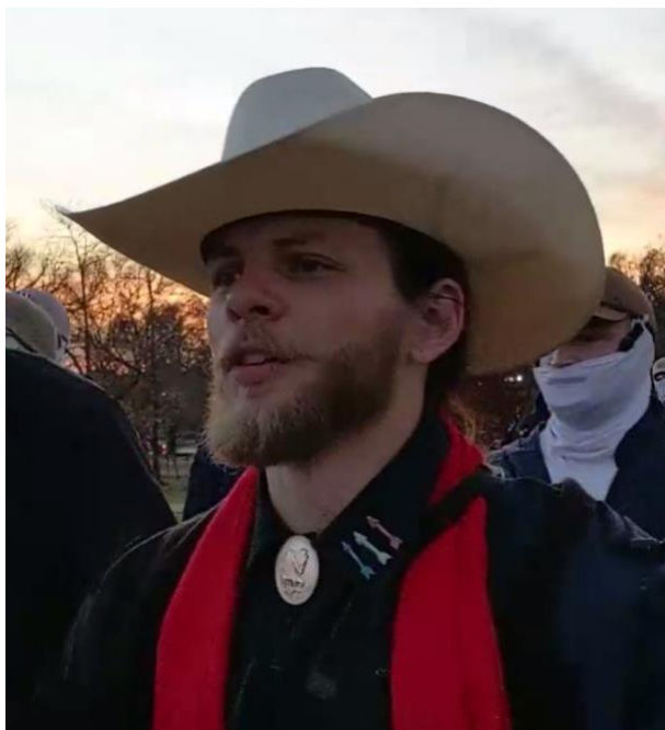
Patriot Front leader Thomas Rousseau during a march from the Lincoln memorial to the capitol building in Washington D.C. on 6 December 2021.