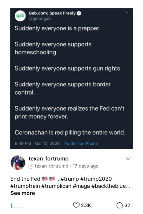
Above: corona-chan tagged post drawing on civil war-related themes.